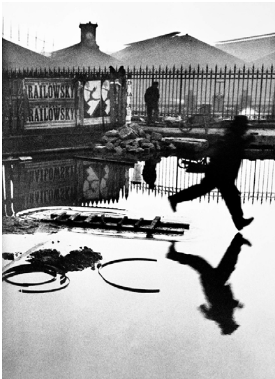
Henri Cartier-Bresson Behind Saint-Lazare Station, Paris, France, 1932

Study your two chosen photographs carefully, and read their labels. Then fill in the diagram.